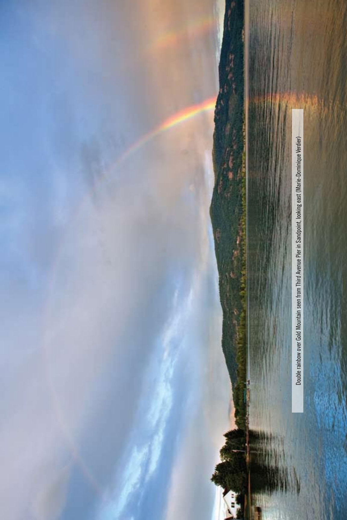
Double rainbow over Gold Mountain seen from Third Avenue Pier in Sandpoint, looking east. (Marie-Dominique Vertier)