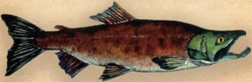
Spawning kokanee (Eileen Klatt)