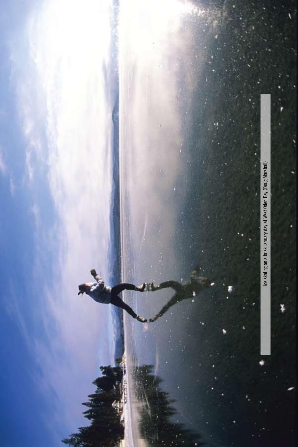
Ice skating on a brisk January day at West Oden Bay (Doug Marshall)