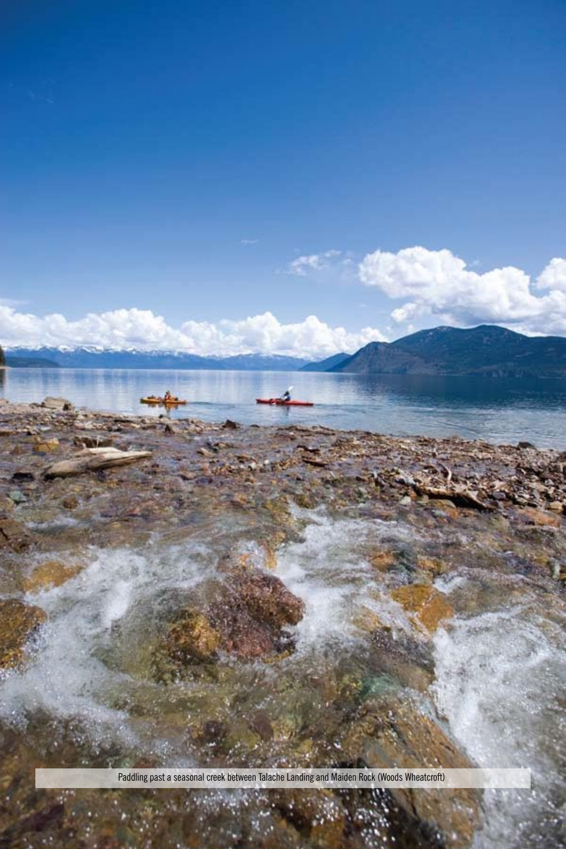
Paddling past a seasonal creek between Talache Landing and Maiden Rock (Woods Wheatcroft)