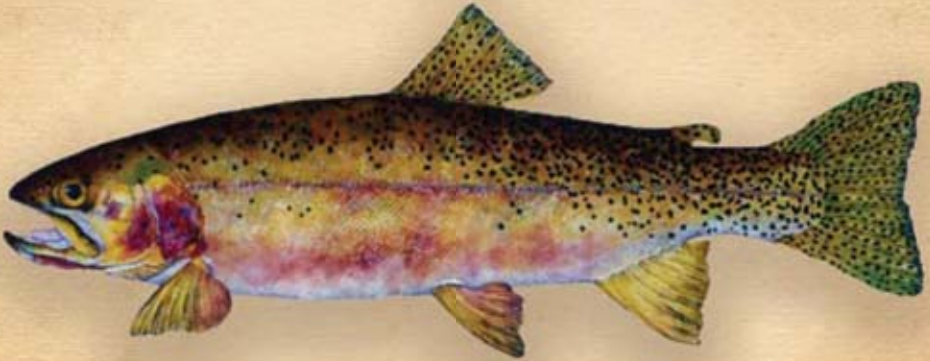
Cutthroat trout (Eileen Klatt)