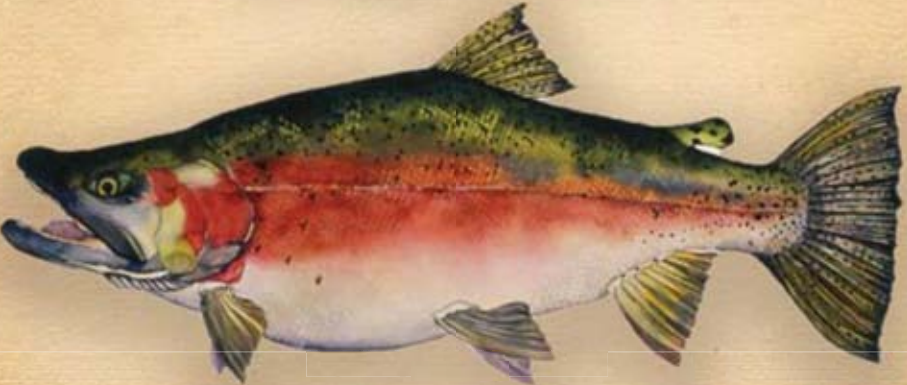
Kamloops trout (Eileen Klatt)