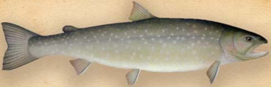
Bull trout (Ward Tollbom)