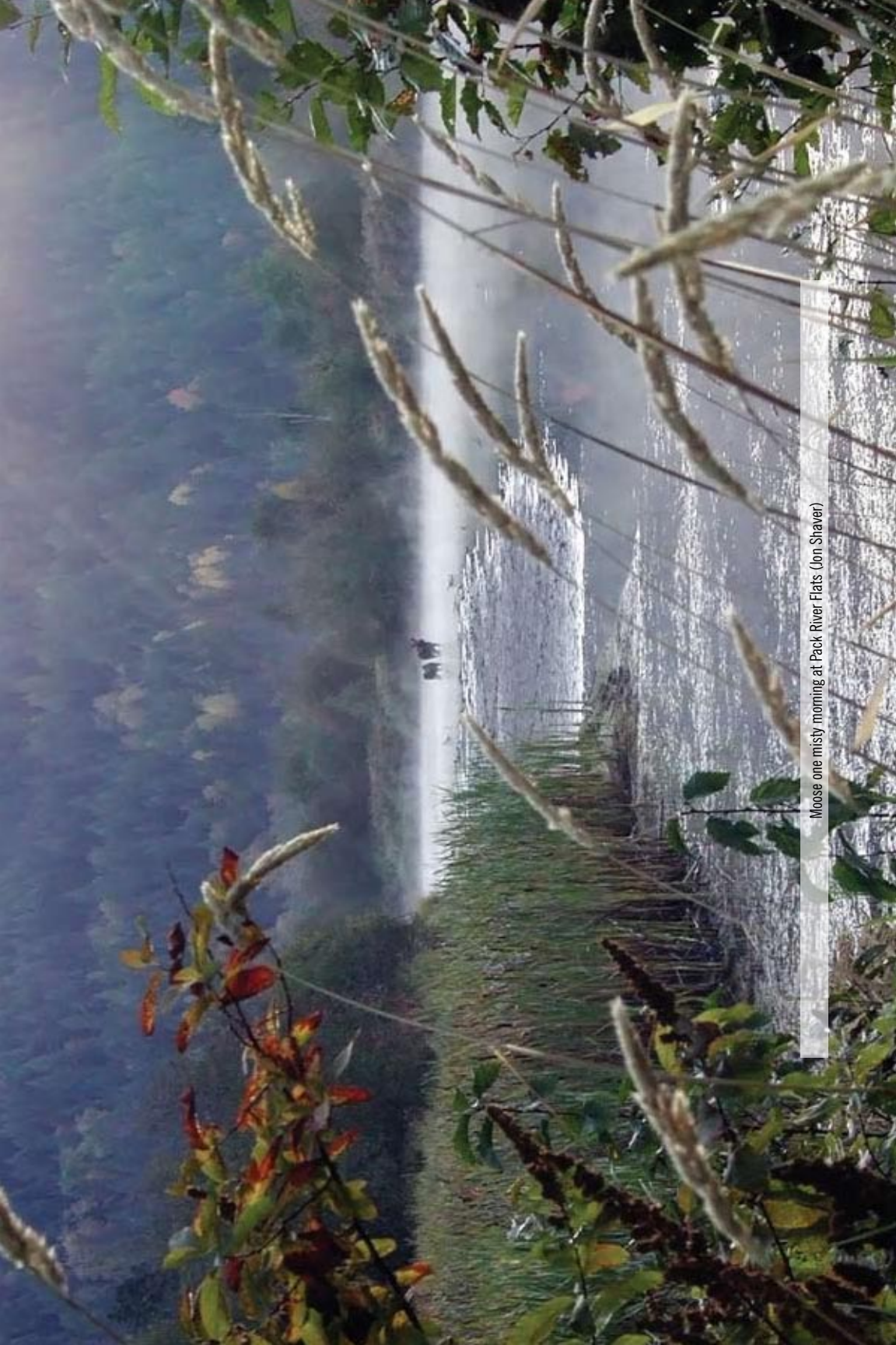
Moose one misty morning at Pack River Flats (Jon Shaver)