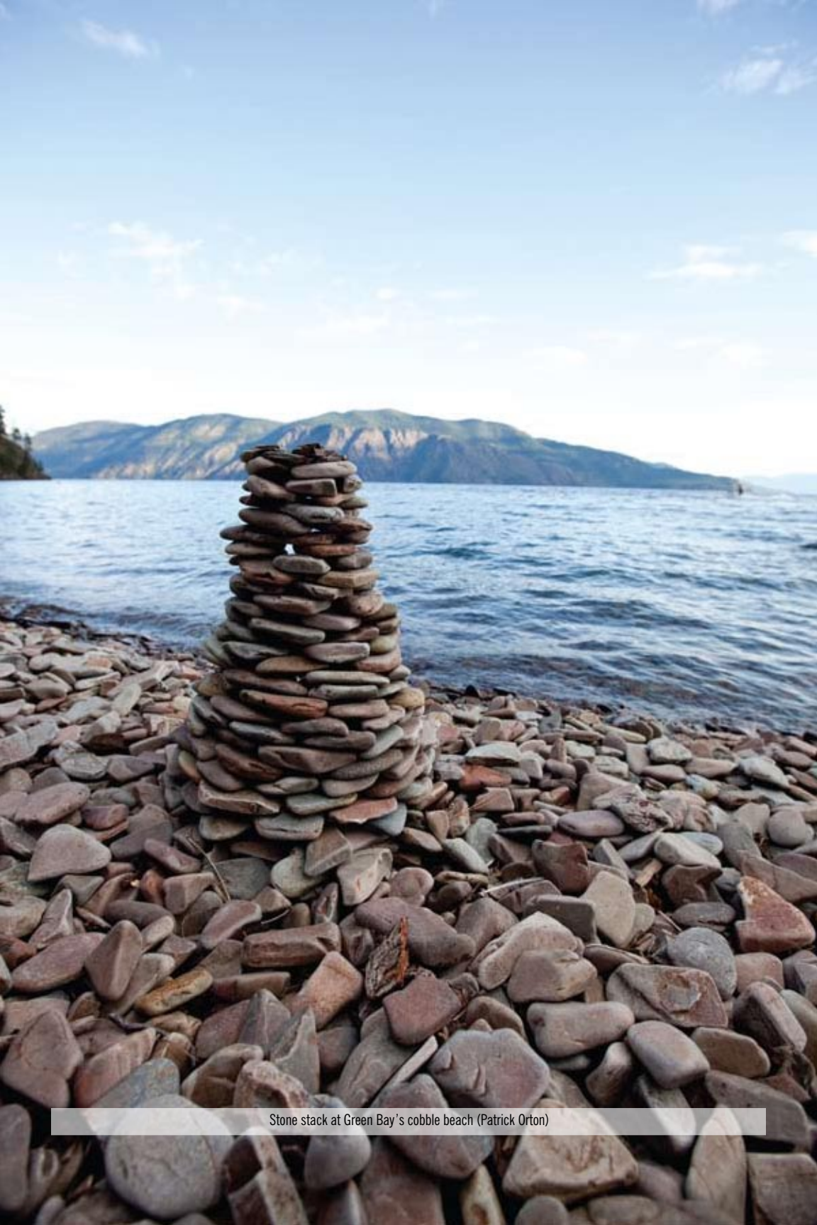
Stone stack at Green Bay's cobble beach (Patrick Orton)